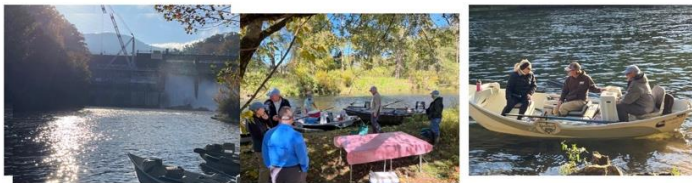
Organized by Jim Murray