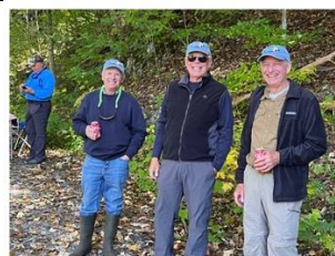
It was a great time meeting friends and enjoying Freshly prepared Tuna steaks!